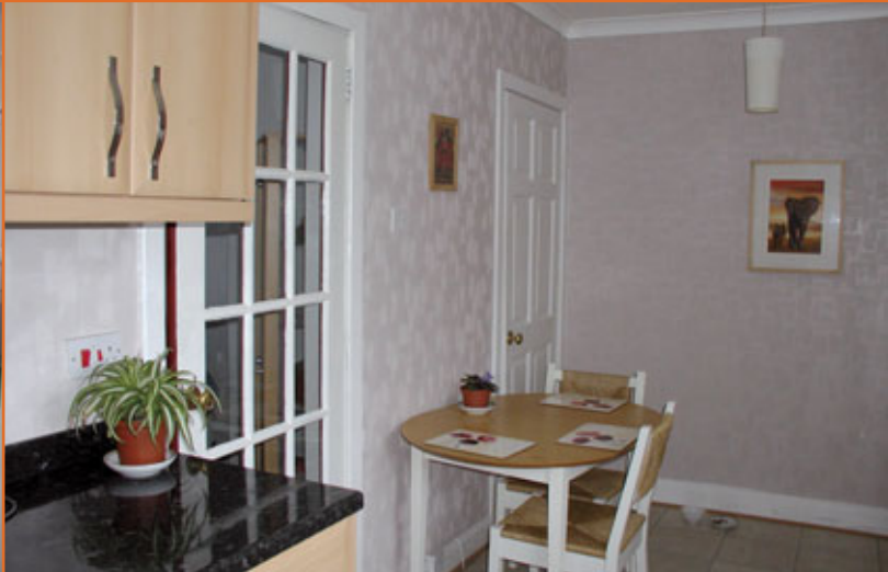
PENICUIK, 20 LAWRIE DRIVE EH26 0HQ