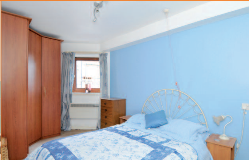
POLWARTH, FLAT 9, JOHN KER COURT, 42 POLWARTH GARDENS, EDINBURGH EH11 1LN